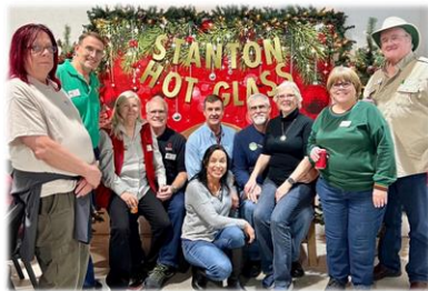
Group at Stanton Studios

At Homestead Heritage the members embarked on a trip back in time when things were simpler and made by hand. The tour consisted of a trips to different shops where actual community members were making items by hand and displaying their handywork. The shops included a pottery house, blacksmith stable and woodworking building, as well as an actual mill grinding wheat with a mill stone that was over a 100 years old and turned by water!