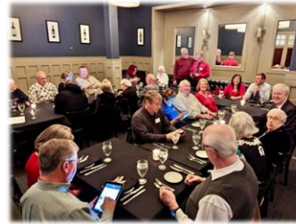
Group Dinner in Diamondback's

Saturday started early with a hotel breakfast, followed by members being shuttled downtown to see some of the attractions Waco has to offer. The members enjoyed tours of the Dr Pepper Museum, Texas Ranger Museum and of course a stop at Magnolia Silos, TV personalities Chip and Joanna Gaines' attraction. After lunch and more shopping, the members were shuttled back to the hotel to rest up and hit the hospitality room before dinner.