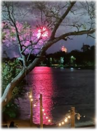
Fireworks on Brazos