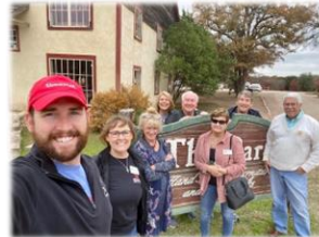
Group at Homestead Heritage