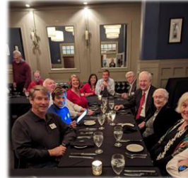
Group Dinner in Diamondback's