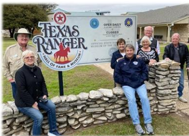
Group at Texas Ranger Museum