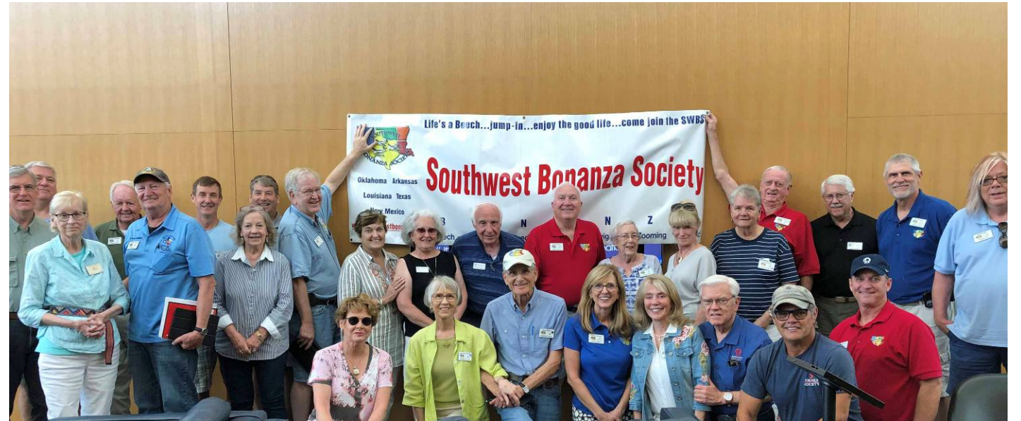
SWBS Gate12 Fly In, June 12, 2021