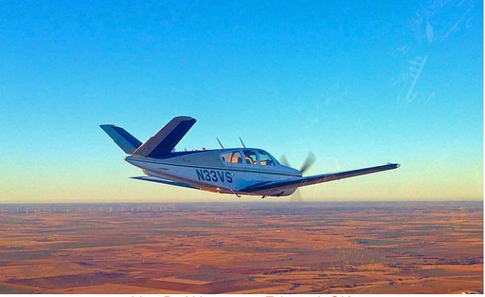
V-35B, Al Lavenue, Edmond, OK