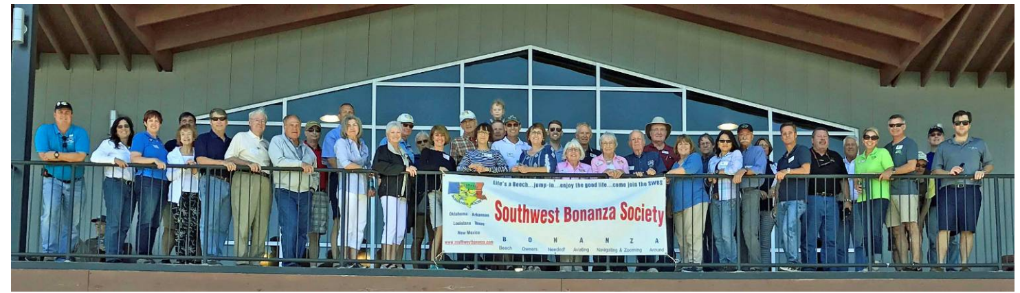
SWBS 2017 Annual Meeting, May 6, Eastland, Texas