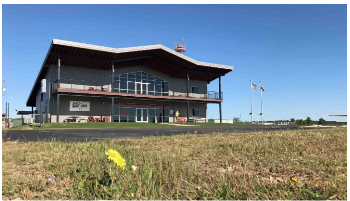
Eastland Terminal Building