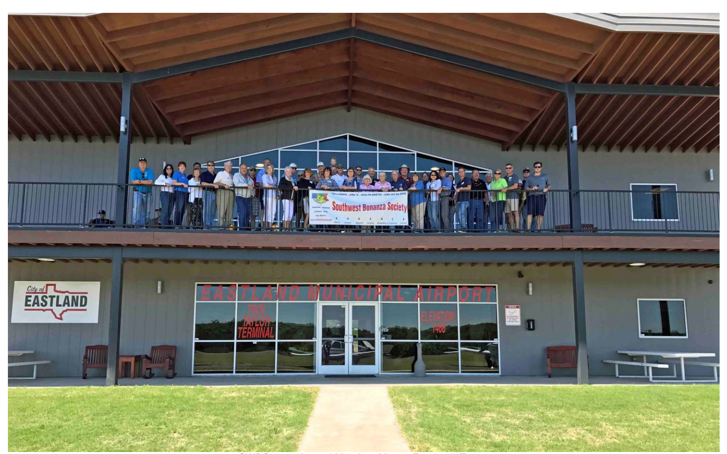
SWBS 2017 Annual Meeting, May 6, Eastland, Texas